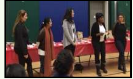
School Council Parents & Chair

On January 20th , the School Council hosted a luncheon for all staff members. We had the opportunity to sit, relax and enjoy a delicious meal. More importantly, this was an opportunity for parents and staff to come together as a result of our common bond – your children!