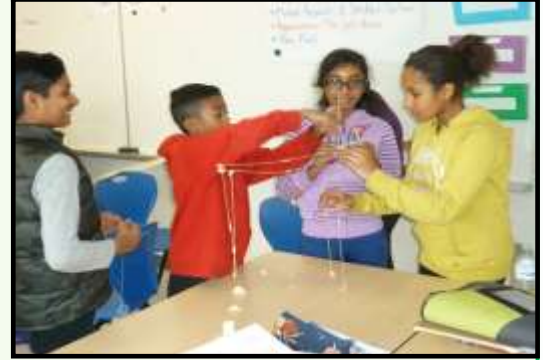
Cooperative Learning in Grade 7!